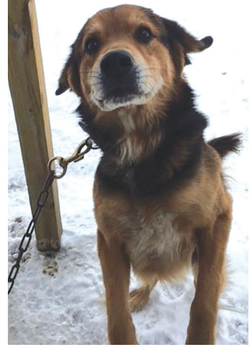
Gordy & Friends gives pet owners options beyond leaving pets chained outside.